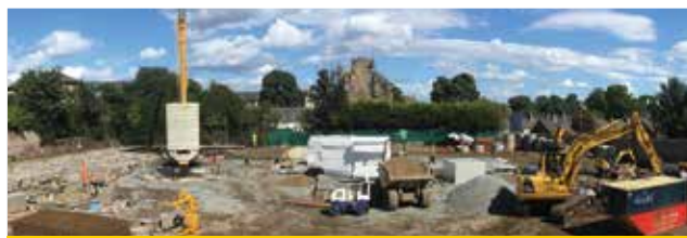
Loaning Road, Edinburgh - £5.4m