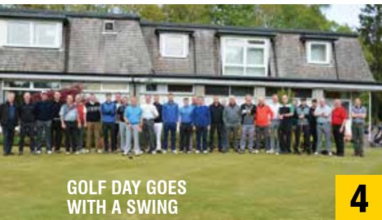
GOLF DAY GOES WITH A SWING