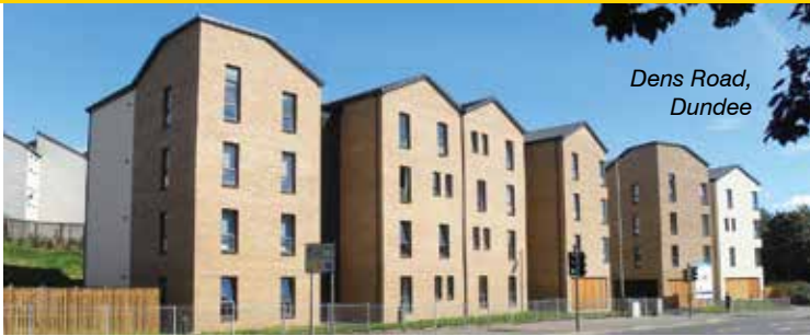
Dens Road, Dundee