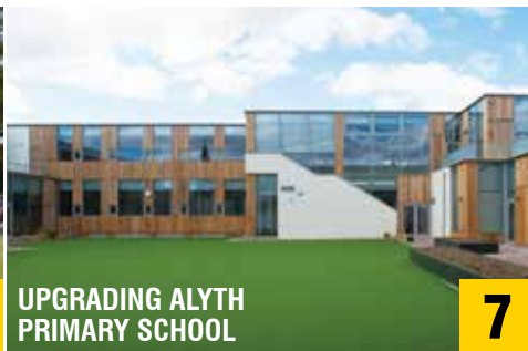
UPGRADING ALYTH PRIMARY SCHOOL