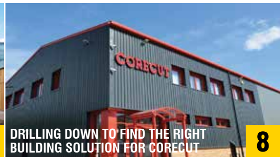
DRILLING DOWN TO FIND THE RIGHT BUILDING SOLUTION FOR CORECUT