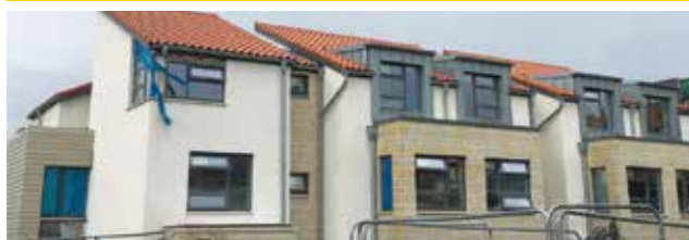
Cramond Care Home, Edinburgh - £7.4m