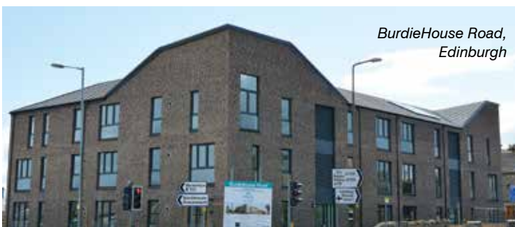
BurdieHouse Road, Edinburgh