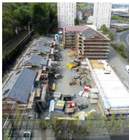
Bay Street, Port Glasgow - £3.1m