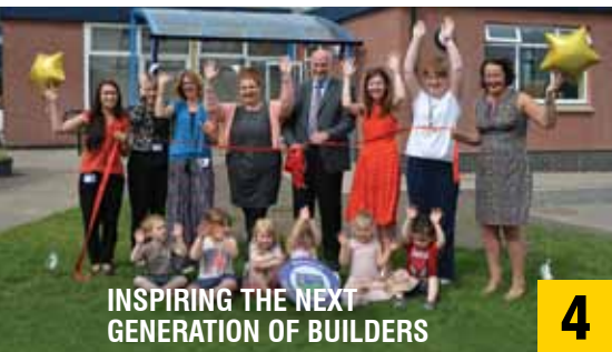
INSPIRING THE NEXT GENERATION OF BUILDERS