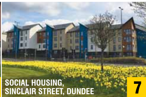
SOCIAL HOUSING, SINCLAIR STREET, DUNDEE