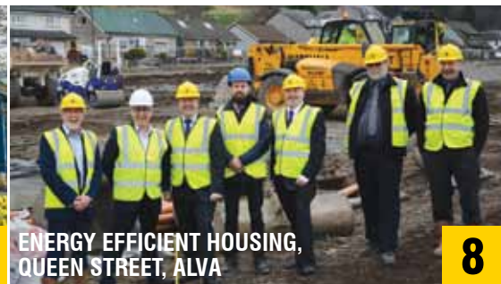
ENERGY EFFICIENT HOUSING, QUEEN STREET, ALVA