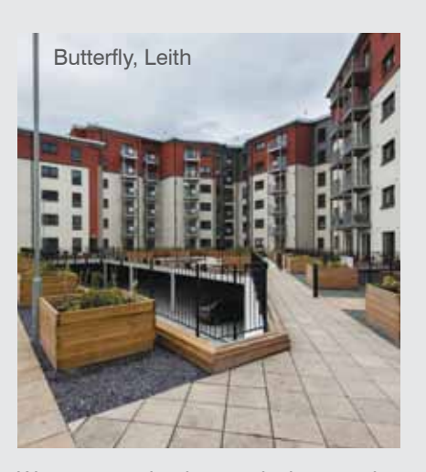
We are committed to employing people and therefore benefitting the local community.

Our service is delivered by a multiskilled, experienced management team supported by directly employed skilled operatives covering the key trades of Joiners, Electricians, Plumbers, Brick layers, Roofers, Tilers, Decorators, Plasterers, Renderers, Rough casters, Concrete and Drainage squads. The majority of our employees are long serving with many building their skills and experience through our long established Apprenticeship Scheme.