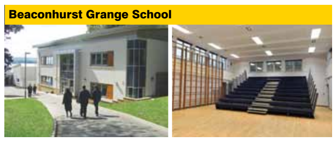
Property: Beaconhurst School, Bridge of Allan

Description of Works carried out: An extension to laboratories plus alterations and refurbishment of existing ground floor laboratories. A single storey, steel-framed building with a flat roof was insulated, walls were given a rendered finish and extensive mechanical and electrical work was carried out.