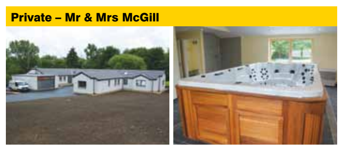
Property: Sealstrand, Dalgety Bay, Fife Contract Value: £455k

Description of Works carried out: The conversion of existing office accommodation to a multi room hospital ward. Works included full strip out of existing layout and services and the construction of new partition walls to form single and four bed wards with en-suite facilities.